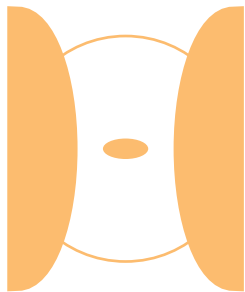
View of the cervix using a standard speculum